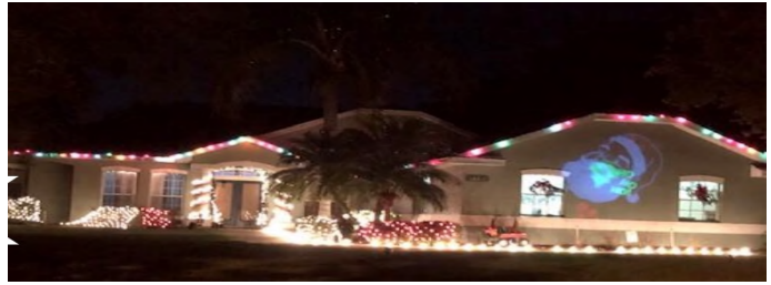
16517 Arrowhead Trail