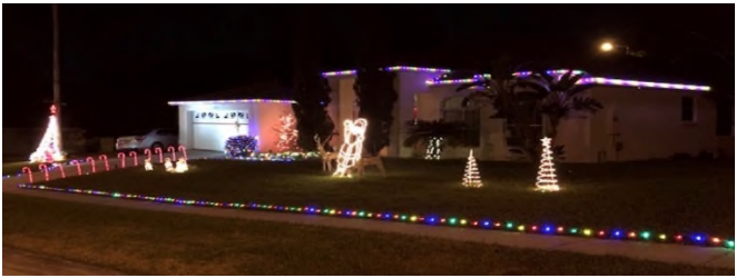
16327 Arrowhead Trail